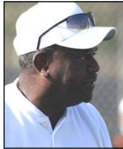
Wes Covington July 17