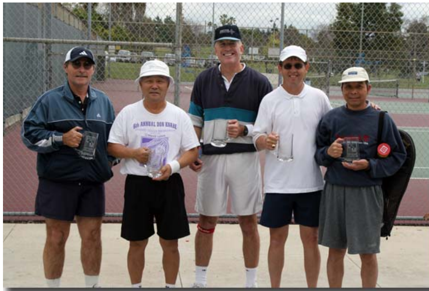
"The Champions—2006 Winter League!"

matches, thereby taking the league lead by one game, and at the same time taking the league lead and championship? The miracle didn't happen and the Nets , as they had done during every round, won two (2) of their three (3) matches. The Nets are the 2006 Winter League Champions!